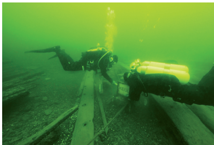
The first underwater heritage park in the Baltic, the Kronprins Gustav Adolf 18th century wreck situates off Helsinki in Finland.

When creating best practices for implementing the MSP in the region, it's necessary to recognize that the Baltic Sea is not only a vulnerable ecosystem but also a unique and fragile treasure of marine- and underwater heritage. Heritage sector has a huge task to integrate the relevant heritage data timely and in proper format in to common MSP approaches. Counting the heritage is not enough, since, quoting Professor Mike Robinson, for common processes it is necessary even to make heritage to count. ■