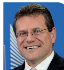
MAROŠ ŠEFČOVIČ Vice President European Commission

The envisioned single energy market will provide Europe with energy which is secure, competitive, and sustainable.