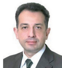
ANDRII OLEFIROV Ambassador of Ukraine to Finland

The Strategy for Sustainable Development "Ukraine 2020" presented to the public in September 2014 determines concrete reform areas aimed at promotion and safeguarding of state interests of Ukraine in current international environment, as well as directions and priorities of state building. With highly educated labour force (Ukraine ranks 4th in the world by the number of people with higher education), unique geographic location, natural resources and advanced industrial base, Ukraine has all possibilities to further modernize its economy, deepen trade with the EU, thus creating preconditions for full-fledged political and economic integration into the Union. ■