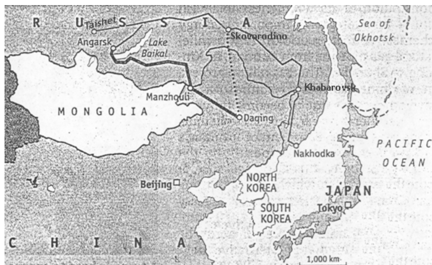
Map 2 Russian far eastern oil pipelines

In the wake of the growing competition between Asia's two largest oil consumers, the Russian government delayed making a decision on the routing of the pipeline. In the meantime, its Energy Ministry reportedly favoured a compromise plan which was to build a 1,700-km pipeline linking Angarsk to Chita, a town about 50 km from the Chinese border. From there, the pipeline would be divided into two, with one going to Nakhodka and another running south to Daqing. In making the proposal, Moscow stressed that the pipeline stretching towards Nakhodka would be the key pipeline of the plan, with the one going to Daqing being a separate branch (SCMP 2003a, 2003b; Ta Kung Pao [Hong Kong], March 16, 2003: A7).