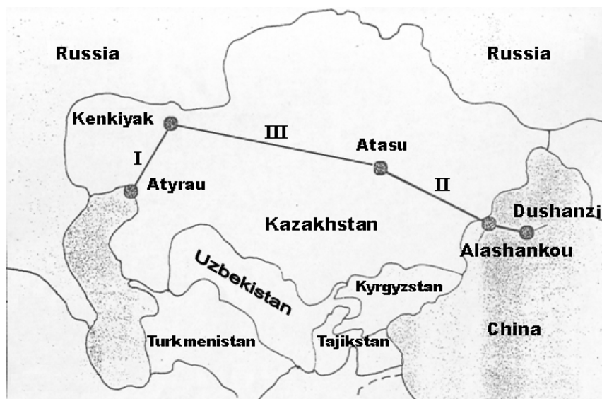
Map 1 Sino-Kazakh oil pipeline