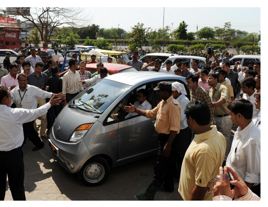
The $2,200 Nano car, made by India's Tata Motors, is just one among hundreds of new products that can turn traditional price and cost structures on their heads

Consider that more than 70 million people are crossing the threshold to the middle class each year, virtually all in emerging economies. By the end of the decade, roughly 40 percent of the world's population will have achieved middle-class status by global standards, up from less than 20 percent today. This means opportunity in consumer markets: P&G, for example, hopes to add a billion new customers to its ranks in the next decade, adding to the nearly four billion the company touches today. In recent quarterly earnings reports, nearly every global consumer products company—from Kraft to Nestlé—noted upticks in profits, driven primarily by unexpected gains in emerging markets.