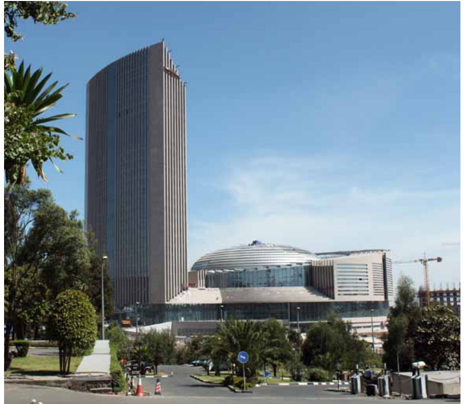
The African Union Conference Center and office complex in Addis Ababa, Ethiopia, built with Chinese assistance. Chinese external aid will also finance prestige projects and public works.

Like other countries, China also has an export credit agency (China Export-Import Bank, or Eximbank) that supports Chinese exports to less-developed countries. China Eximbank and the state-owned China Development Bank also have loan funds to support Chinese investors overseas, particularly to help them purchase equipment and machinery from China. Loans from Eximbank can be extended to host governments to help them purchase telecommunications equipment and installation services from Chinese firms, agricultural machinery or planes, or to build infrastructure.