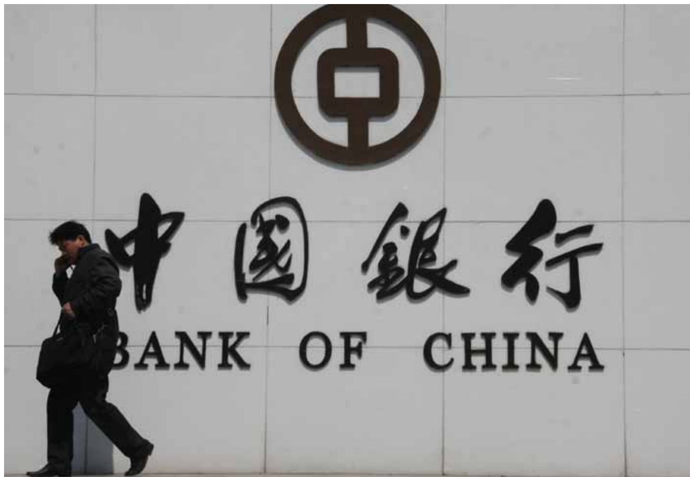
Poor interest returns have created a disincentive to entrust banks with savings—a factor that is now creating problems for China.