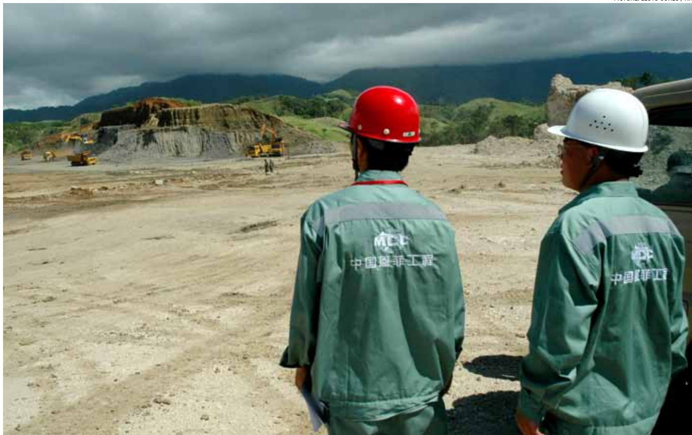
Chinese engineers survey work at the Basamuk processing plant near Madang, part of China Metallurgical Group Corporation's Ramu nickel project in Papua New Guinea. Each site in the Ramu project has 'a distinctive work culture based on shared histories, cultural preferences and local dialects'.

hydroxides, although it is expected that final processing into sulfates will be undertaken in China.