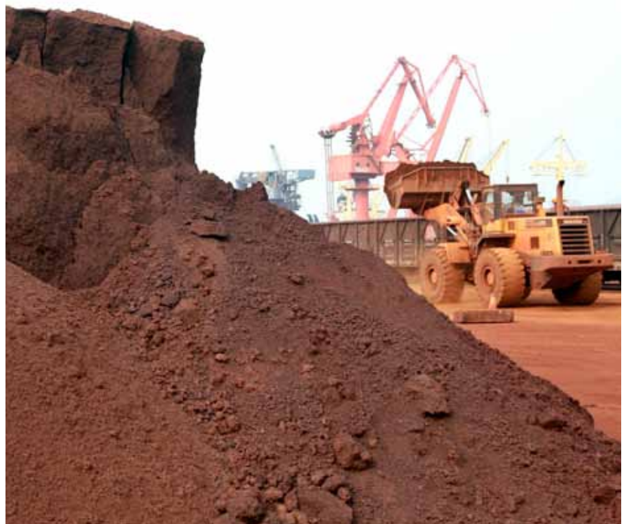
Loading rare earth minerals for export at Lianyungang, Jiangsu province. In 2009-10 China set an export quota of 35,000 tons per year.

The impact of Chinese procurement arrangements on the structure of natural resource industries is only one dimension of the geopolitical challenges surrounding these endeavours. Other dimensions are