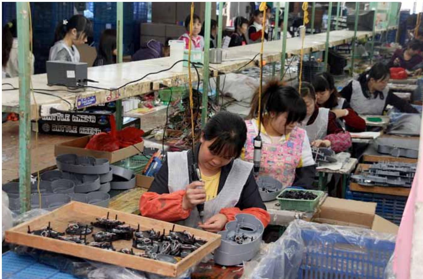
Workers making toys at a factory in Jinjiang: China quickly evolved into the 'manufacturing hub' of the global economy but the Twelfth Five-Year Plan sees China moving up the value-added chain in strategic industrial clusters, modernising key industries and investing in infrastructure.

already considered among the world's most stable currencies. Demand for Chinese goods has facilitated support for its exchange rate, which is currently semi-fixed against the US dollar. If China's fixed exchange rate regime were eliminated, the renminbi would likely appreciate anywhere from 20 per cent to 50 per cent, giving Chinese investors an immediate advantage in buying international assets. Although the peg is unlikely to be abandoned in the near future, international pressure on China to appreciate the renminbi will intensify, especially with imports worsening the balance-of-payments situation and harnessing GDP growth rates in many countries around the world.