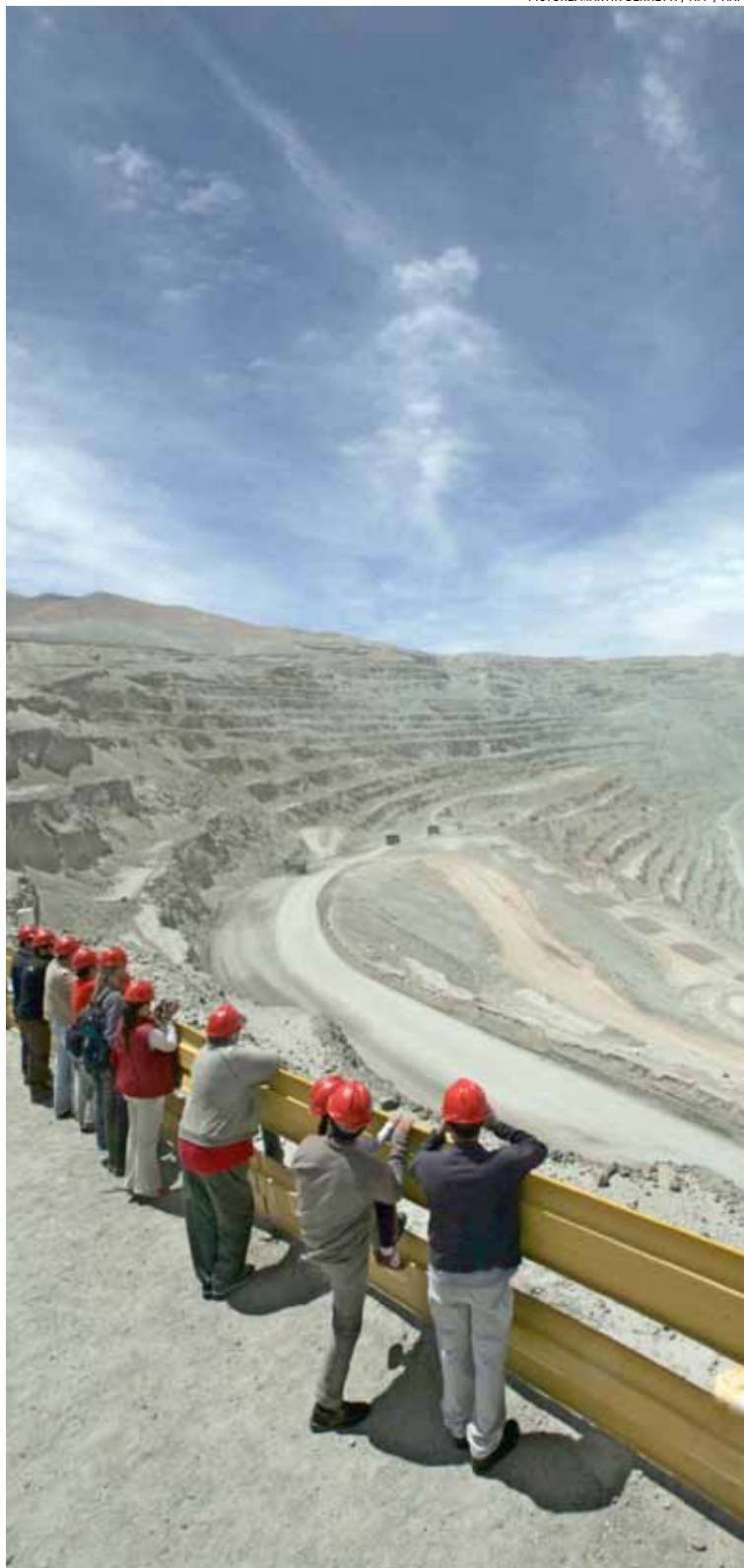
Visitors inspect an open cut copper mine near Calama, Chile. Increasingly, Chinese corporations are adapting their strategies to cope with their international expansion, including those in Latin America.

faced difficulties in adapting to an environment in which civil society demands compensation from companies—although the track record of Chinese firms operating in Peru’s mining industry shows there has been consistent progress since the early 1990s.