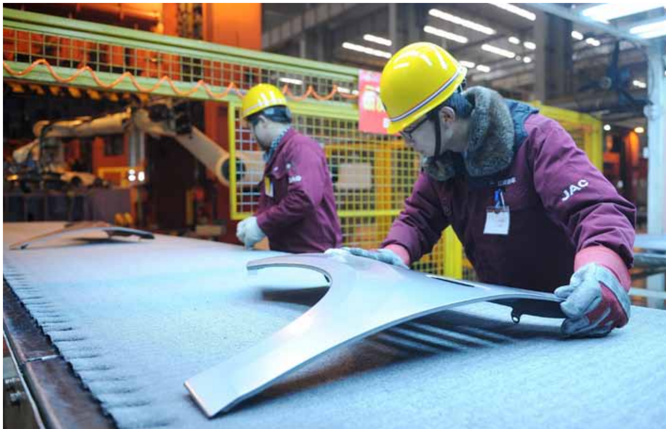
Car workers assembling vehicles at a plant in Hefei, Anhui province. With Chinese outward direct investment, a company's main production facilities will usually remain in China rather than relocating abroad.

China can only become a dominant ODI investor globally if the private sector plays a more prominent role. China's state-owned enterprises (SOEs) often face tougher challenges overseas because of their perceived linkages with the Chinese state. Regulators and competitors in host countries regularly accuse SOEs of using state-provided resources to achieve government objectives in their investment projects, even if these investments are purely commercially orientated. To be fair, this suspicion is not completely groundless, as SOEs often use their state linkages to disadvantage domestic competitors.