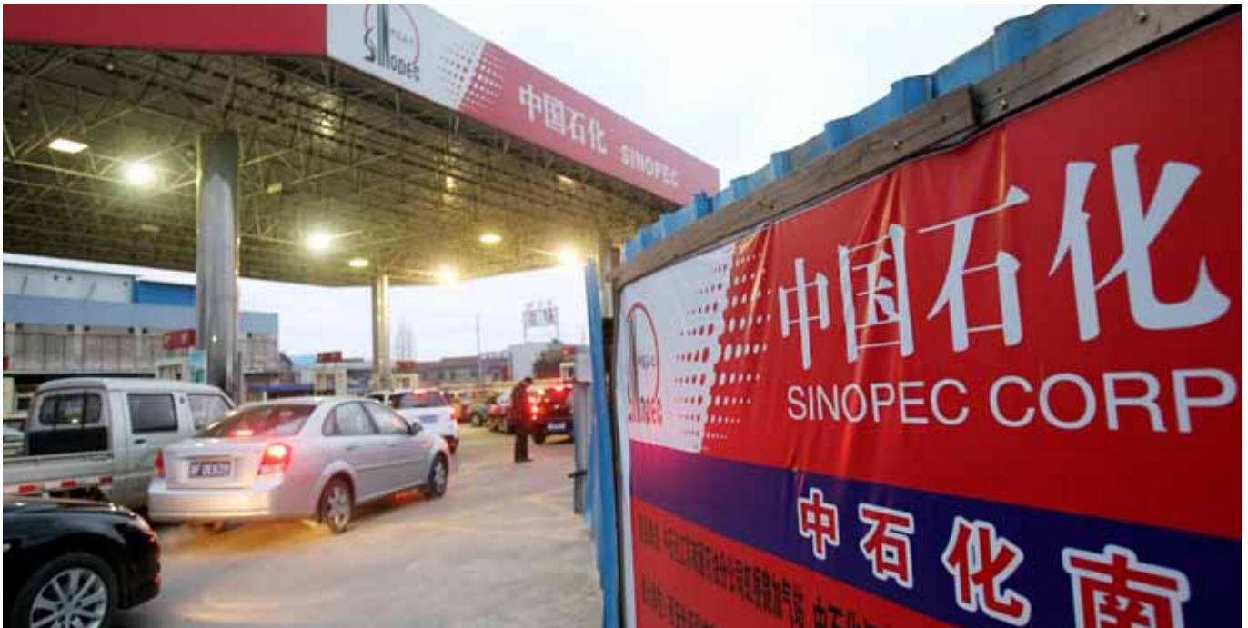
Sinopec is one of the few Chinese firms that has capital, operations and sales on a global scale.

business decisions are often oriented towards short-term profit. There is also a lack of transparency and oversight, which has been linked to a high degree of corruption. Moreover, Chinese companies are politicised: that is, many have Communist Party cells and members embedded within the firm. Most of China's state-owned 'national champion' firms have CEOs appointed by the Organisation Department of the Chinese Communist Party, and this is also true of multinationals. Unlike their Chinese competitors, though, most Western multinationals are apolitical. And this is not where the differences end. Western business culture emphasises teamwork and cooperation between management and staff, detailed long-term planning, transparency and oversight, multiculturalism, prosecution of corruption, and the institutionalisation of relationships.