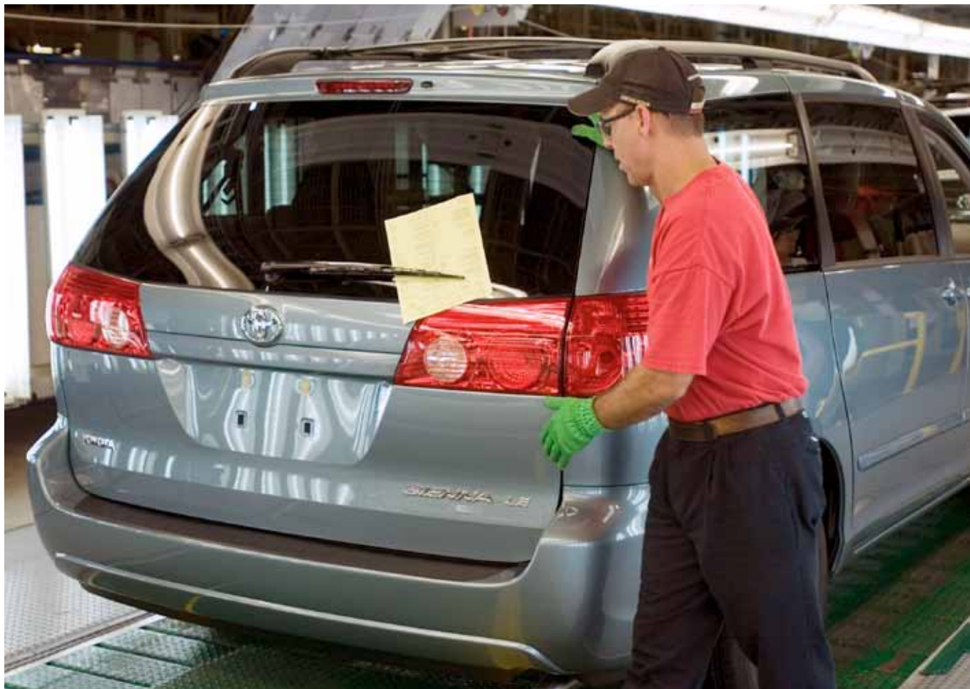
An assembly-line worker in Toyota's Indiana plant puts the finishing touches on a vehicle. Despite the clamour in the 1980s, Japan is now an uncontroversial source of foreign direct investment in the United States.

as the antitrust regime and securities laws) was not designed with Global Fortune 500 companies connected to an authoritarian party state in mind.